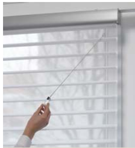
ULTRAGLIDE® LIFTING SYSTEM

Standard control cord loop, secured with a cord tensioner. For enhanced child safety the SILHOUETTE® Shadings cord tensioner must be secured with the pin pulled down before the shade will operate.