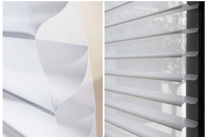
Unique S Vane