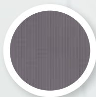
Pearl / Light Pearl